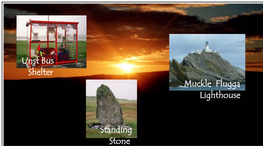
Unst Bus Shelter

I'm looking forward to meeting you; do come and join me.